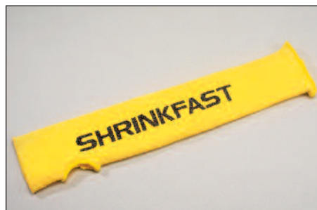
KEVLAR KNIT SLEEVES